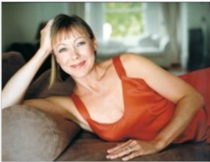
Jenny is also the proud Patron of Ovacom.

We are extremely honoured to be joined by our very special guest, renowned film, stage, TV and radio actress Jenny Agutter whose huge success in the Railway Children film encouraged us to link this year's theme to railways. Jenny's work in theatre, film and television is both extensive and eclectic having also starred in 2 other iconic films Walkabout and American Werewolf in London.