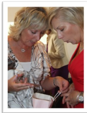
"Ooooo, goody bags"